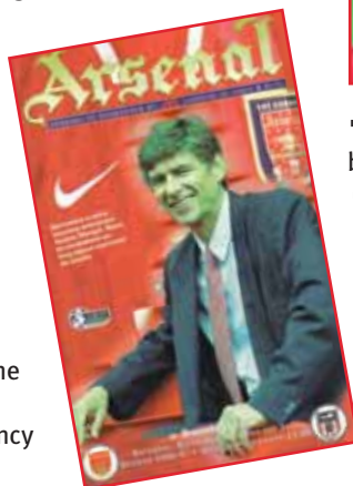
The programme from Arsene Wenger's first game in charge at Arsenal.

The table elsewhere on this page demonstrates the consistency of performance of our team since Wenger arrived at our club, the images that surround this page demonstrate some of the successes and the key decisions made over the last 12 years.